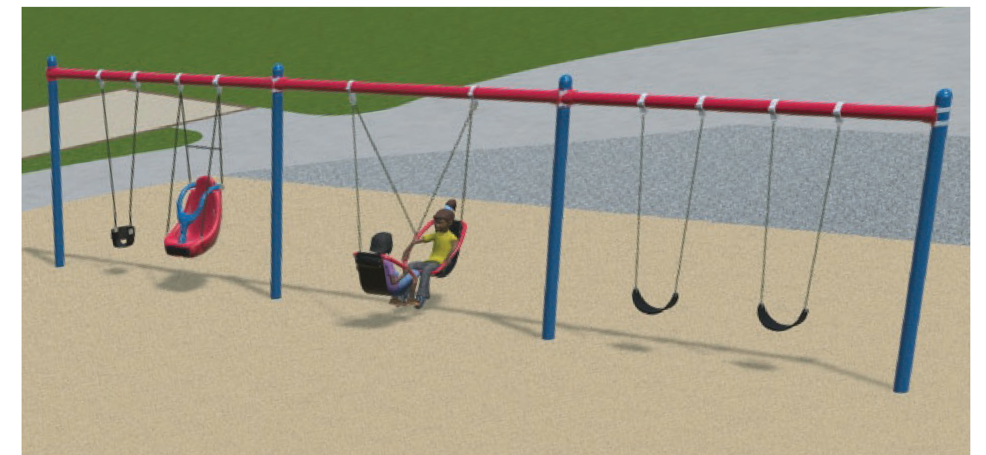
Swings with D. Tot, E. ADA, F. Friendship, and G. Belt Seats (L to R)