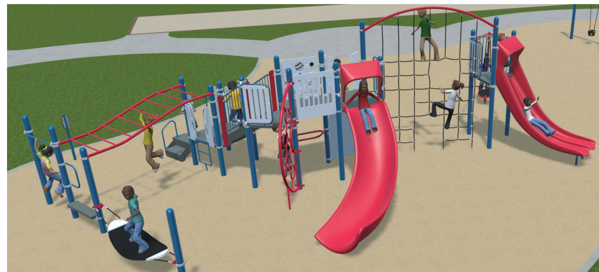
A. Main Structure - view 2