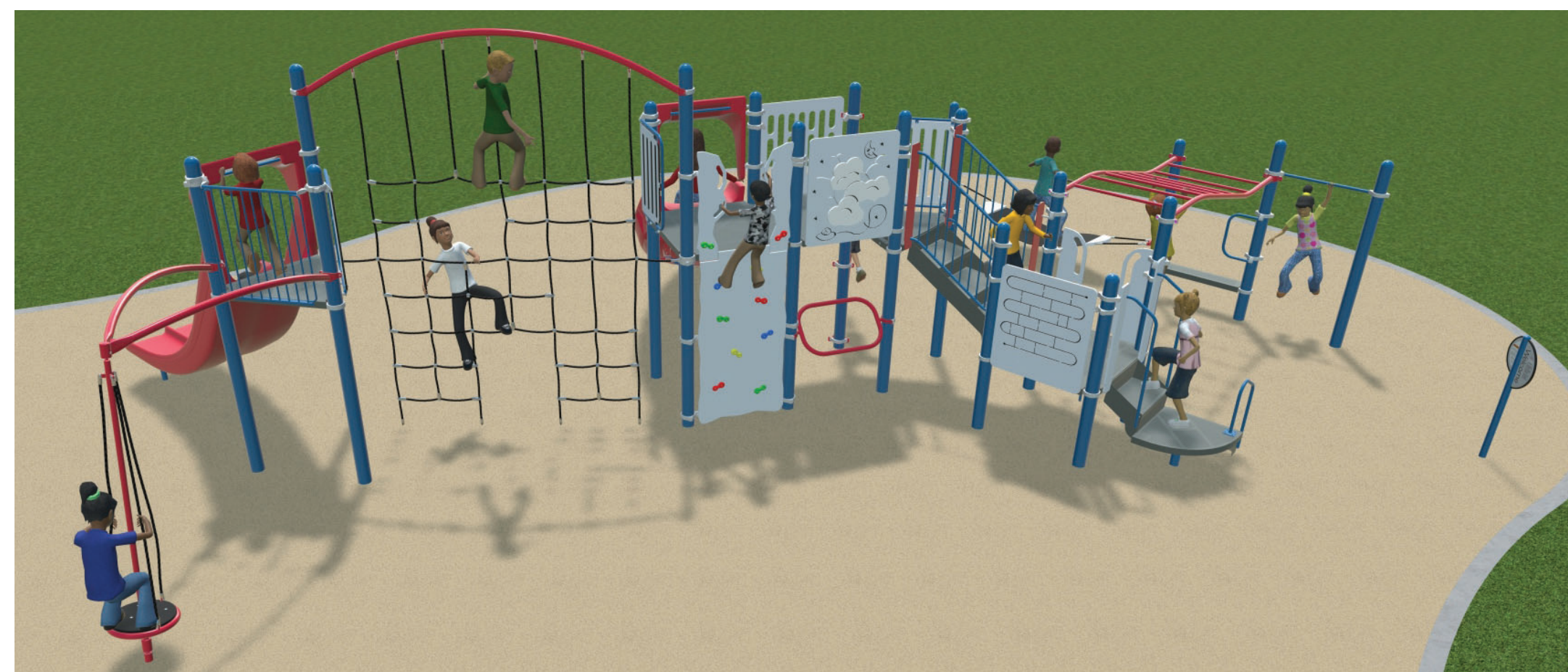
A. Main Structure - view 1