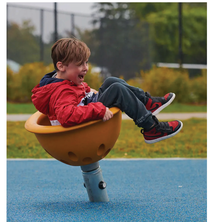
C. Bowl Spinner