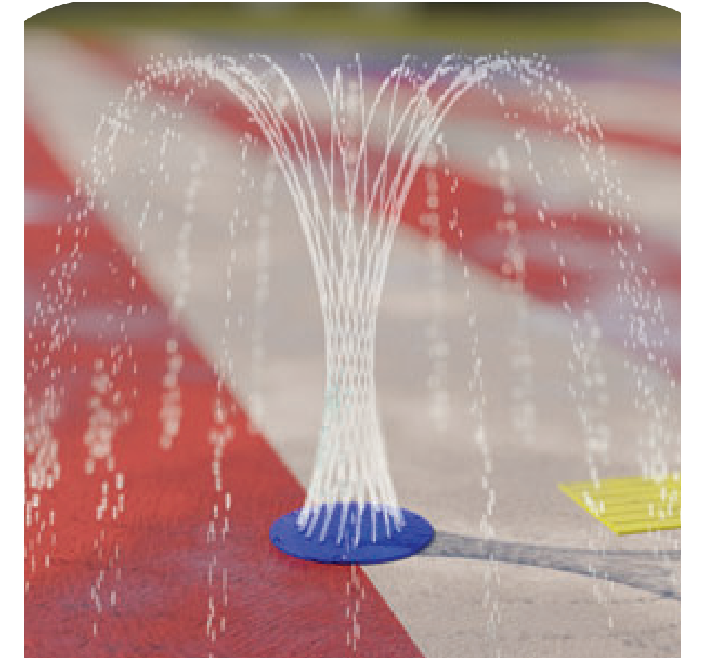
H. Splash Pad Ground Jets and Vertical Features