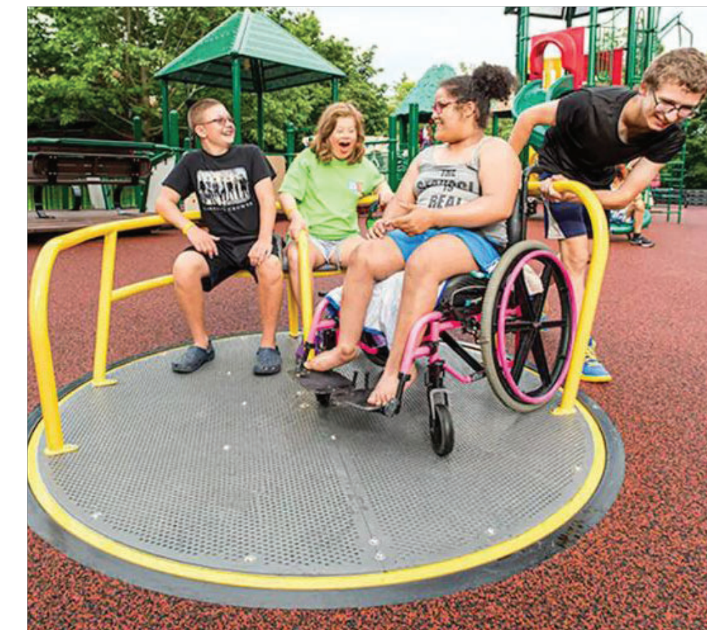
B. Inclusive Whirl