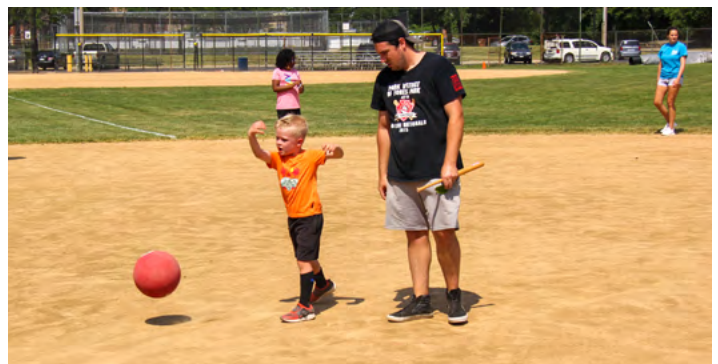
Indoor Kickball, page 4

Find more information on all current and upcoming Park District of Forest Park programs & events and create your account(s) at