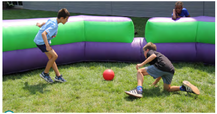
After School Fun Camp, page 3