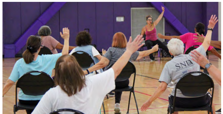
Zumba Gold, page 4