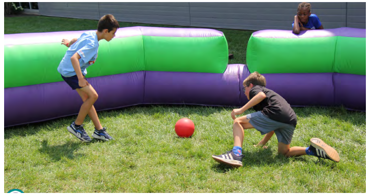
After School Fun Camp, page 3

Questions? Give us a call at 708-366-7500 or e-mail kschlichting@pdofpstaff.org