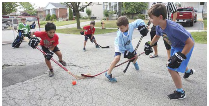
Youth Street Hockey, page 4

Find more information on all current and upcoming Park District of Forest Park programs & events and create your account(s) at https://bit.ly/AmiliaPDoFP